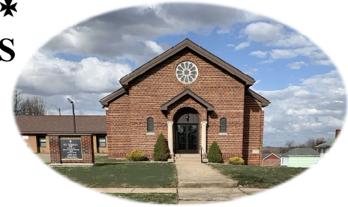
St. Teresa of Avila Cadiz